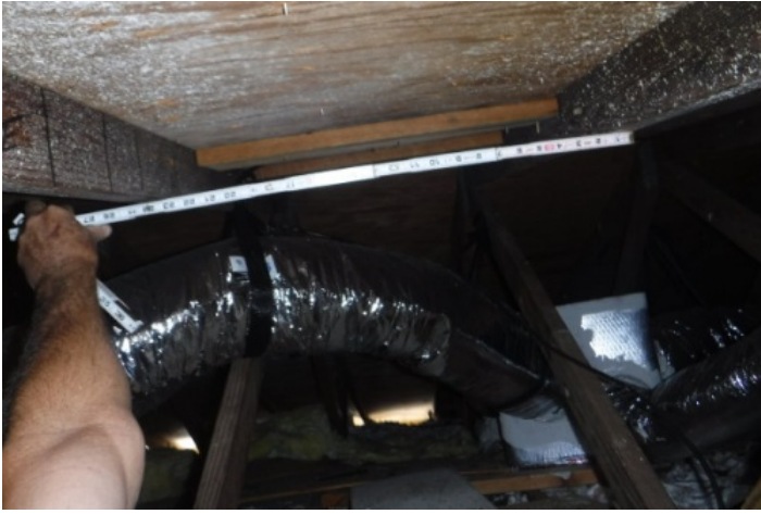
Roof Truss Spacing - 24"