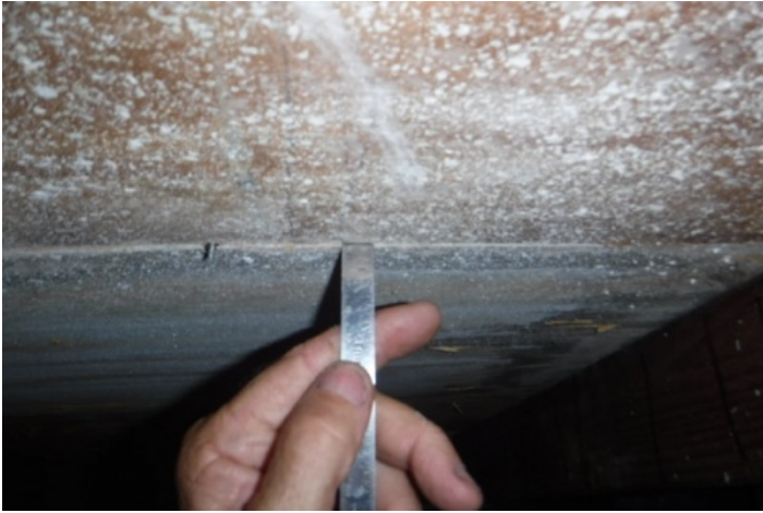
Roof Deck Attachment - 1/2" plywood sheathing