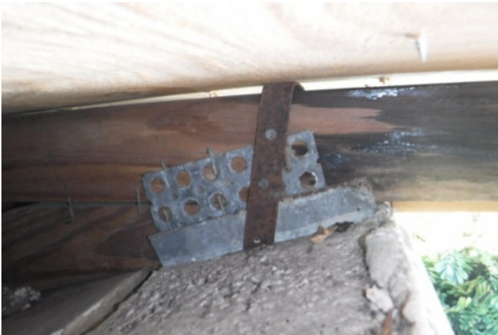
Roof to Wall Connection - single wrap straps front side