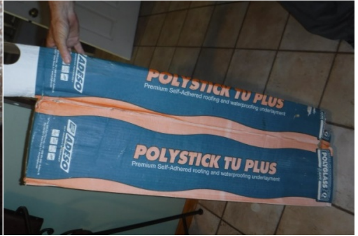
SWR - Peel and Stick