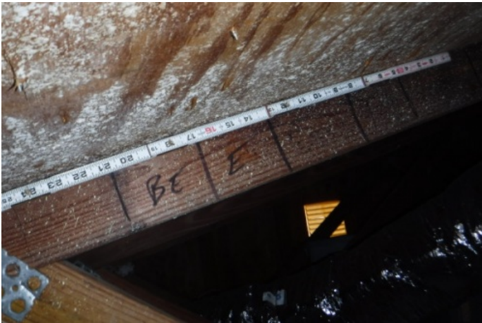
Roof Deck Attachment - 6" spacing on the edge