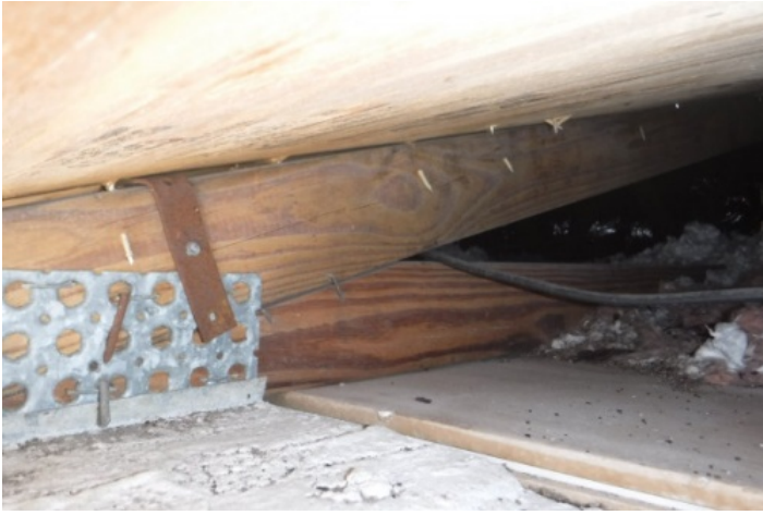
Roof to Wall Connection - single wrap straps back side