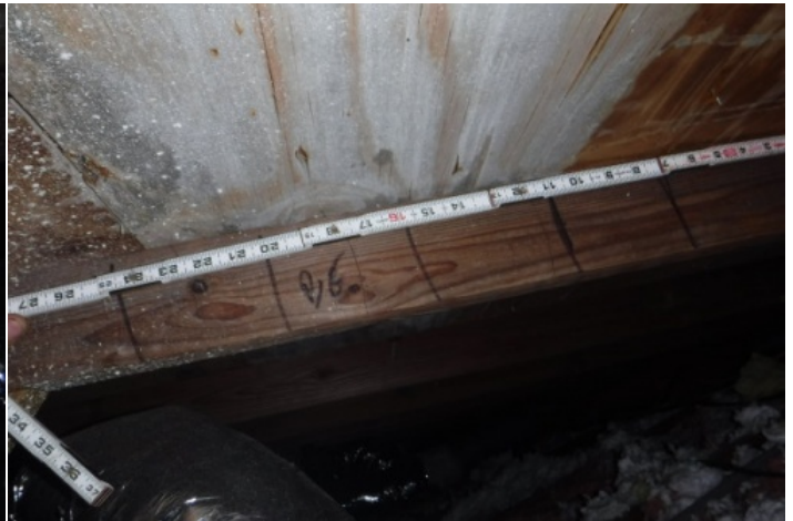
Roof Deck Attachment - 6" spacing in the field