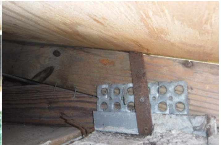
Roof to Wall Connection - single wrap straps front side