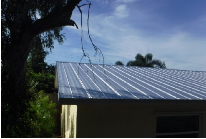
Left Elevation at front