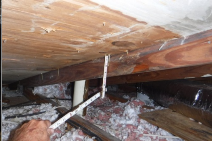
Roof Deck Attachment - 8d nails